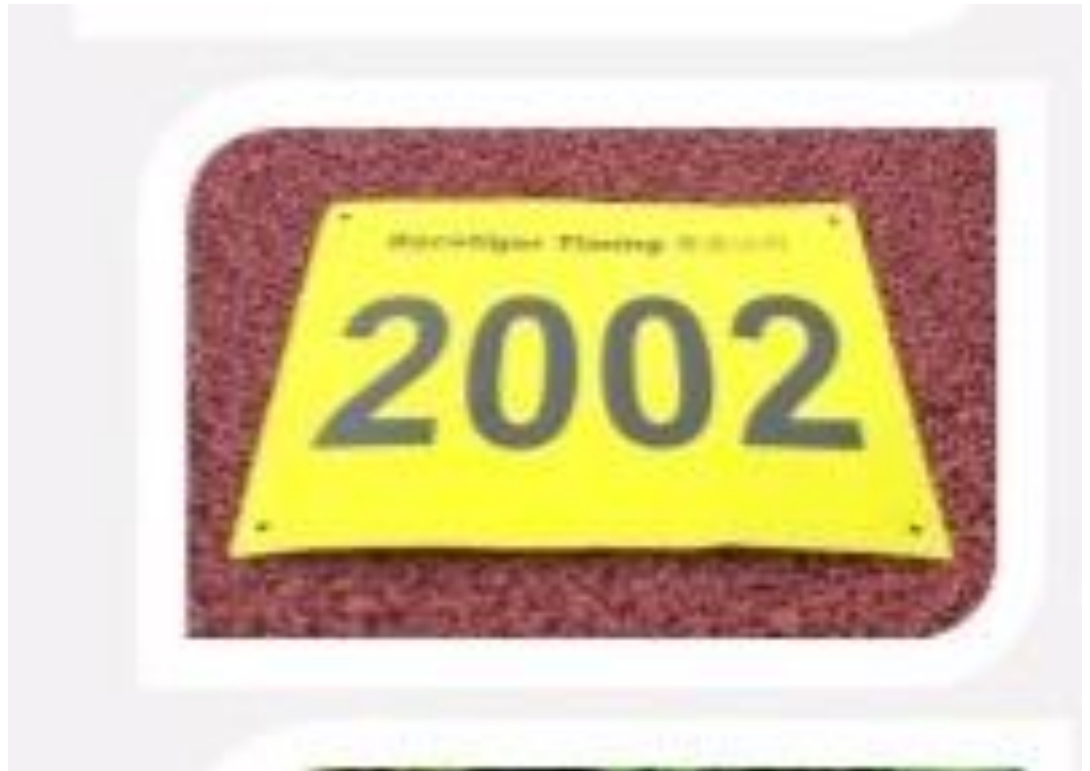
Running Tag (Sample)